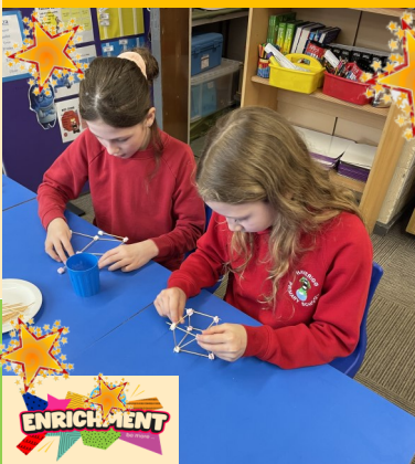
STEM Enrichment session, making towers and structures using toothpicks and marshmallows.

Thank you for all of the wonderful donations of chocolate from our non-uniform day. We have made up 82 prizes for our Easter Chocolate Raffle! Pictured are just a small selection of all the chocolate goodies. The last day to purchase tickets will be Monday 31st March and the raffle will be drawn during the last week of term. We do have spare envelopes for ticket purchases if anyone needs any extras for friends or family, just call at the office to collect. Thank you and good luck!